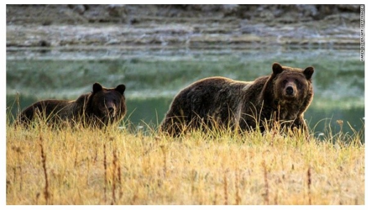
A grizzly bear mother and her cub walk near Pelican Creek in 2012 in Yellowstone National Park.