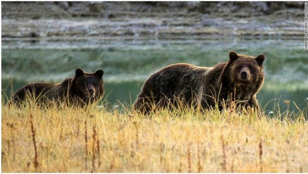
A grizzly bear mother and her cub walk near Pelican Creek in 2012 in Yellowstone National Park.